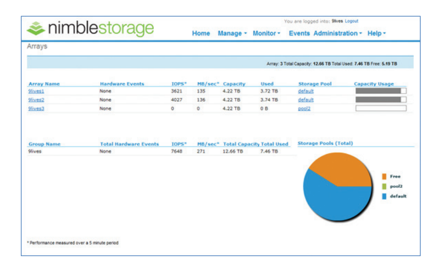
Figure 3: Management UI to manage the scaleout cluster as one.

lel access, hosts are automatically configured to direct reads and writes to the correct array, avoiding any forwarding. For this method of access, the hosts run the Nimble Connection Manager for Windows or PSP plug-in for VMware vSphere.